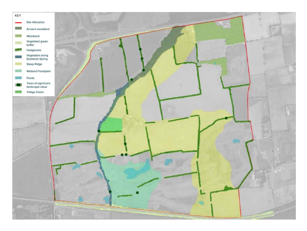
Integrated Green Infrastructure

72. Further detailed work is being undertaken as part of the detailed design work (SPD) which further embeds landscape character and green and blue infrastructure into the built and natural environment at Dunton Hills Garden Village at a fine grain.