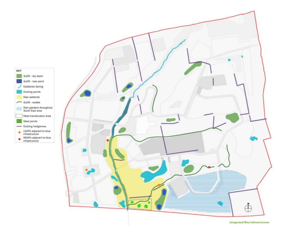
Integrated Blue Infrastructure