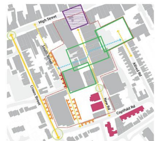
Chapel Ruins Area