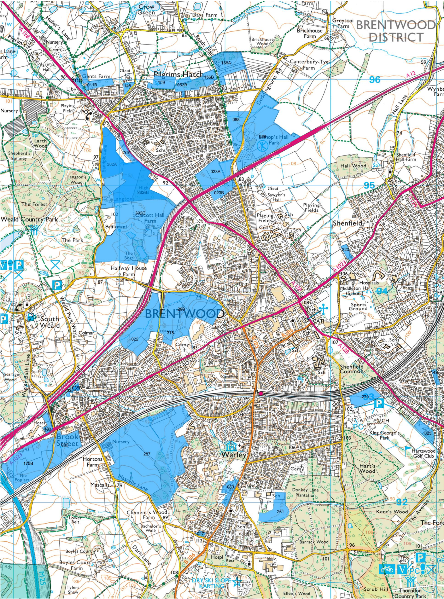
Map 1 - Green Belt edge of Brentwood Urban Area (Brentwood, Pilgrims Hatch, Warley and Shenfield West)