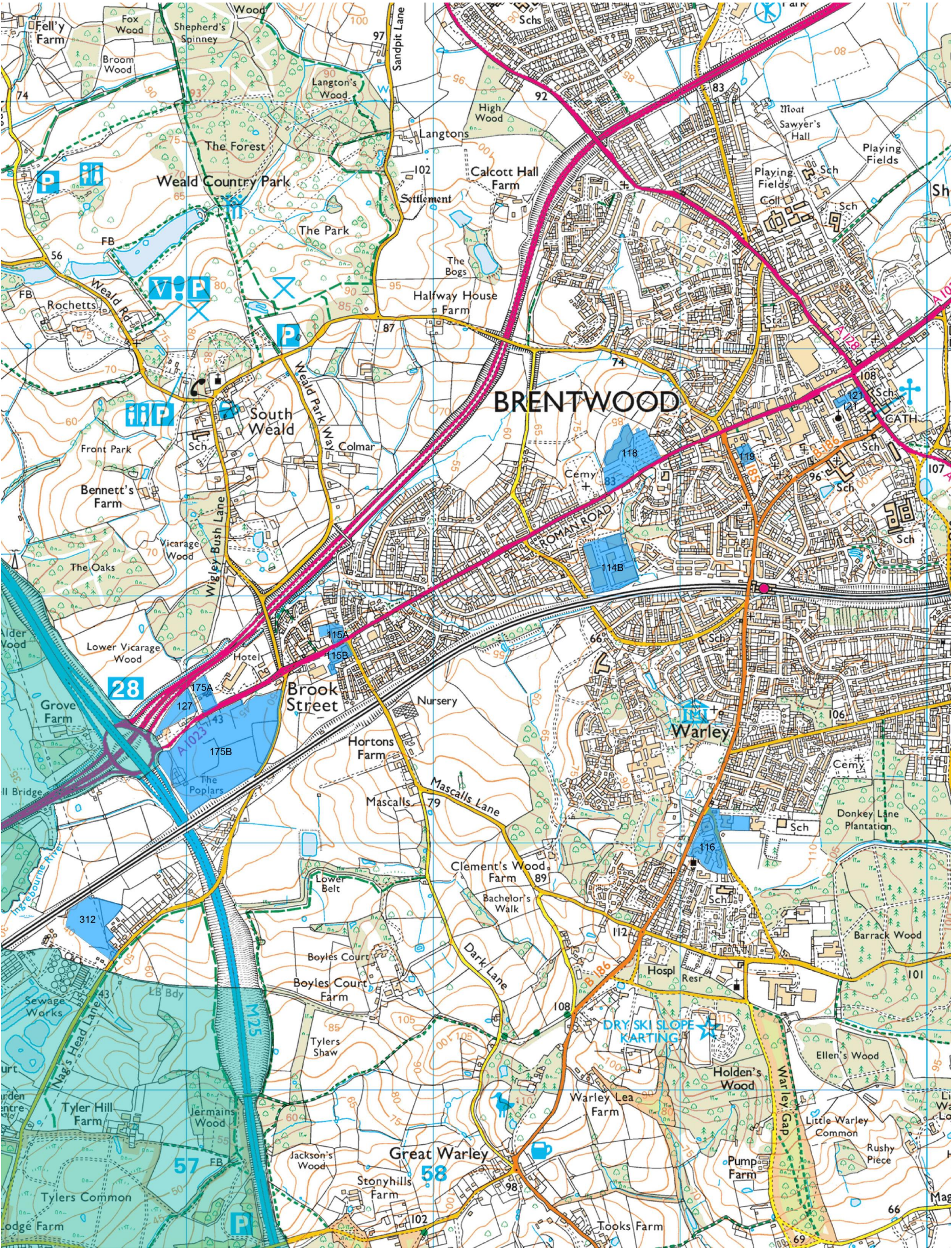
Map 1 – Employment Sites (Brentwood)