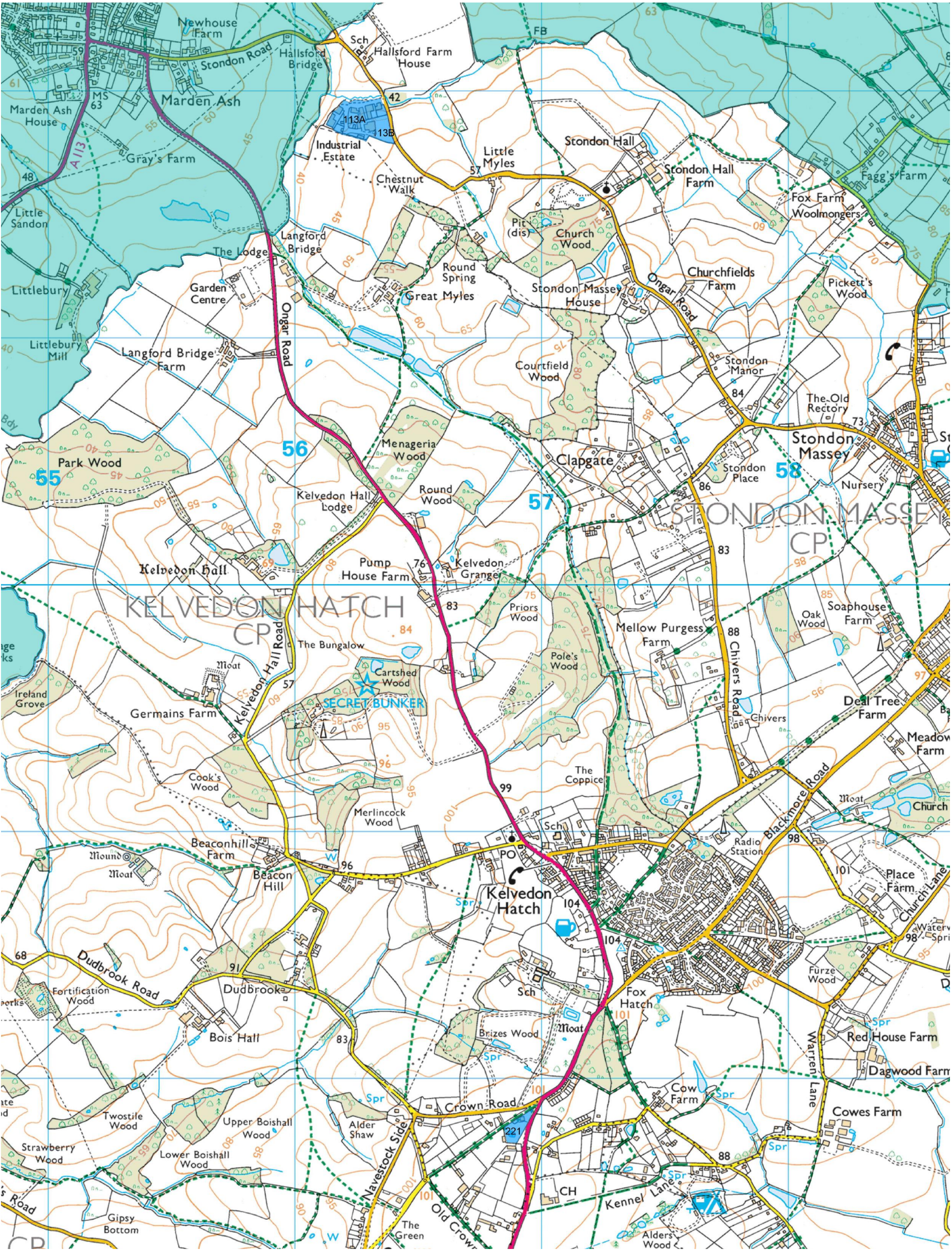
Map 3 – Employment sites (Northern villages)